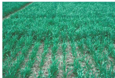
Figure 1. Stunting from an application of 2,4-D to wheat prior to tillering.

Other herbicides that can be applied through flag leaf include Affinity BroadSpec, Affinity TankMix, Ally Extra SG, Express, Harmony, Harmony Extra, Huskie, Quelex, Sentrallas, Supremacy, Talinor Weld, and WideMatch must be applied before the flag leaf is visible.