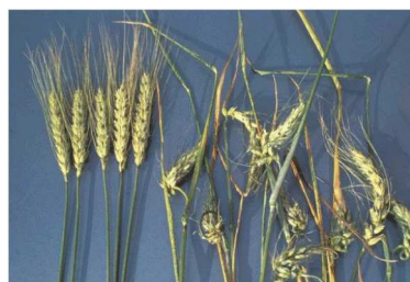
Figure 2. Malformed heads from an application of 2,4-D at boot stage.

For more detailed information, see the “2022 Chemical Weed Control for Field Crops, Pastures, and Noncropland” guide available online at https://bookstore.ksre.ksu.edu/pubs/CHEMWEEDGUIDE.pdf or check with your local K-State Research and Extension office for a paper copy.