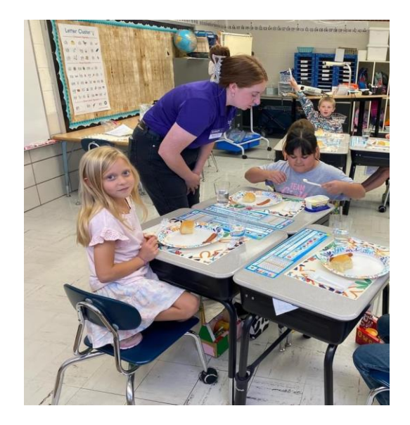
Table Setting and Table Etiquette

This program is designed to facilitate youth's social emotional development. Youth will learn about mindful eating, affirmations, the gift of presence, describing feelings, mood management, quiet listening, as well as yoga.